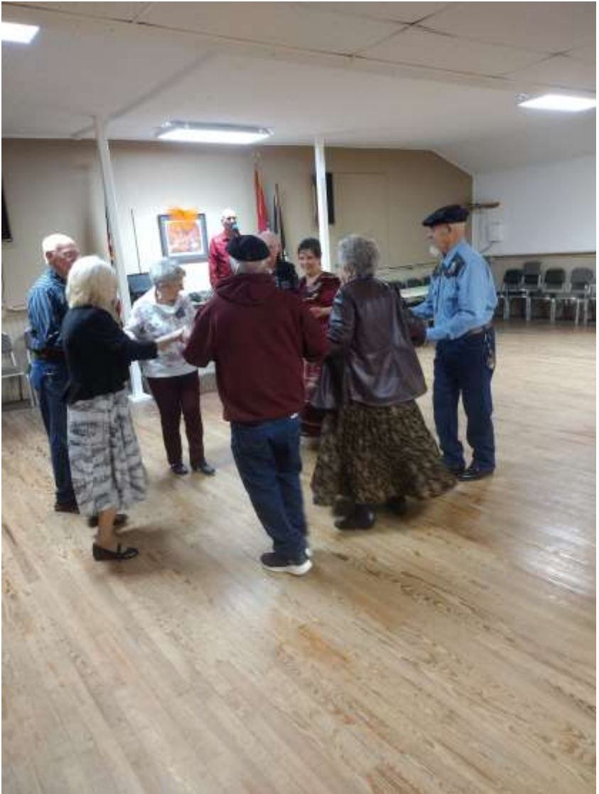
Next, several photos from the Levi's And Lace Jan. 27 Dance.