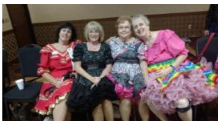
National Singles Trail End Dance with Three Amigo's.