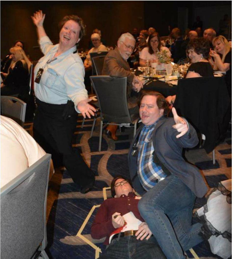
Just a couple of pictures from our dinners in Atlanta at the 68NSDC Pre Convention.