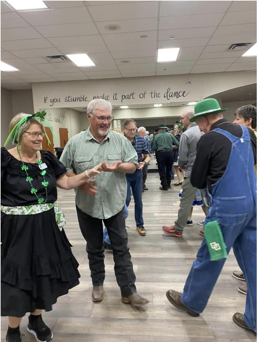
Next, two photos from the Twirling Funtimers St. Patty's Dance. See their club report for further details.