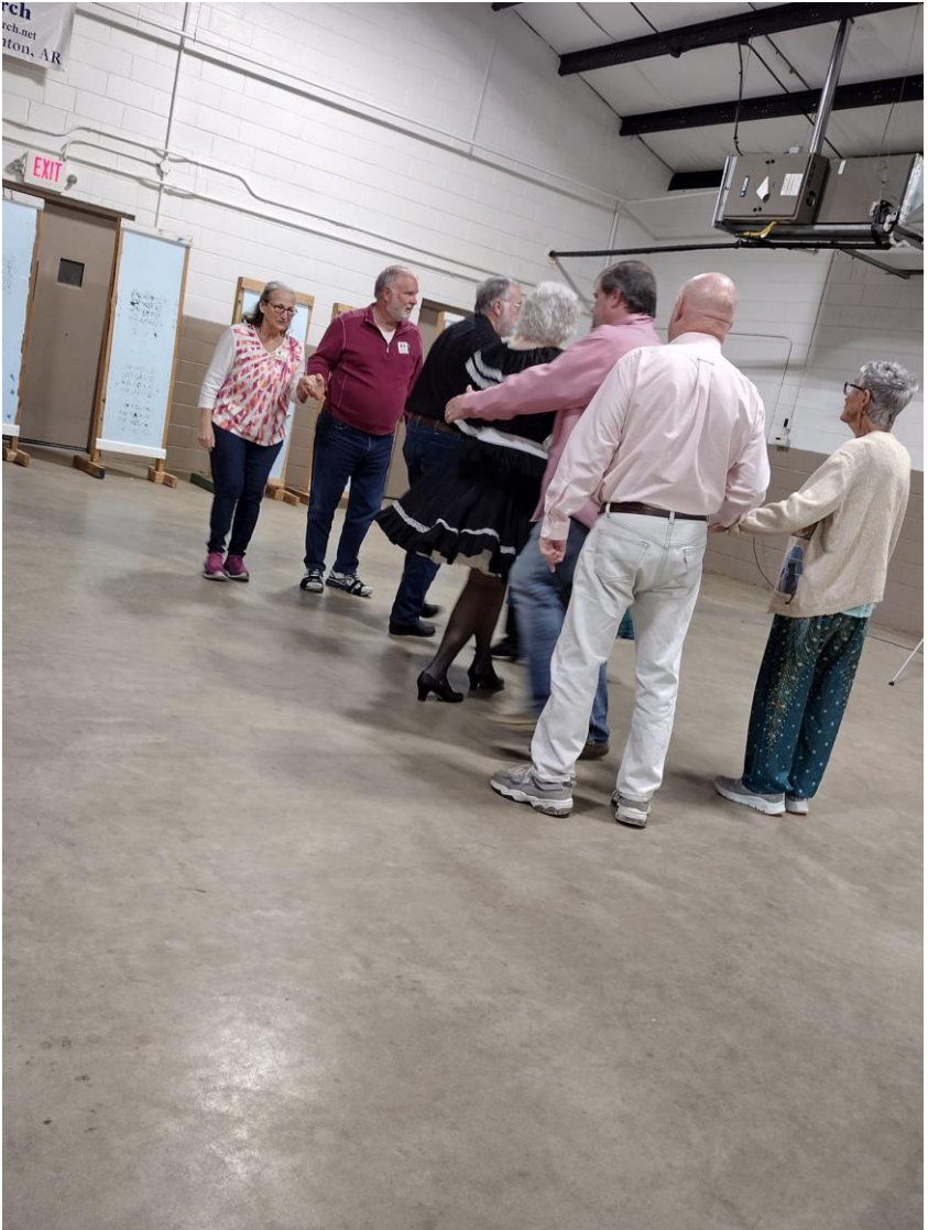
Next, several photos from the Maverick Mixers Spring Fling Spaghetti Dinner And Dance. See their club report for details.