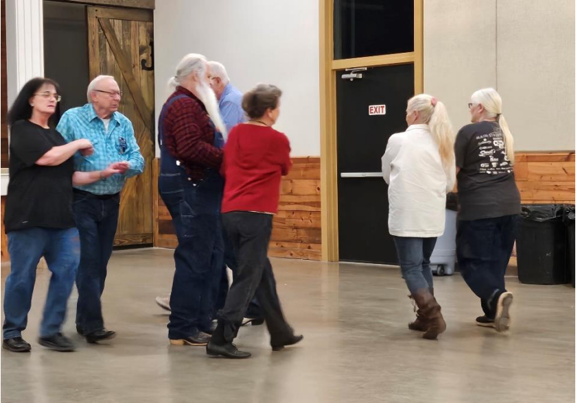
Next, several photos from the Heber Springs St. Patrick's Dance on March 8 in Rosebud.