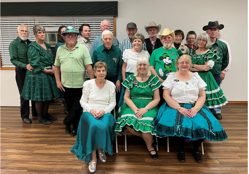
Next, several photos from the Bluebird Squares March 2 dance. See their club report for details.