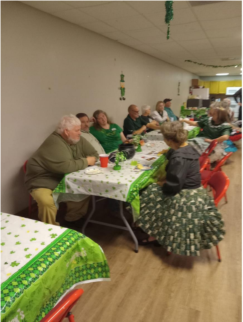
Next, several photos from the River City Squares St. Patrick's Dance on March 12. See their club report for details.