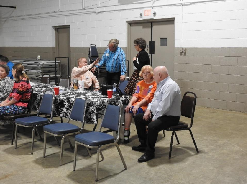
Next, several photos from the River City Squares Sep. 21 dance.