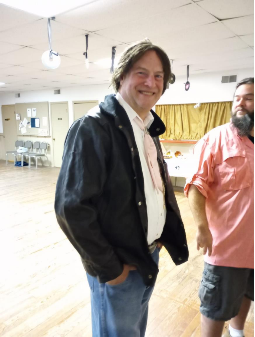
Next, several photos from the Pioneers Hobo Dance on Sep. 26.