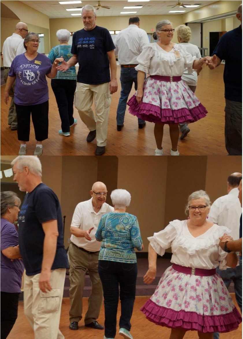
Next, several photos from the Heber Springers Hillbilly And Graduation Dance on Sep. 23. Just like the Levi's And Lace Graduation Dance recently, it was filled with "balloonacy"!!