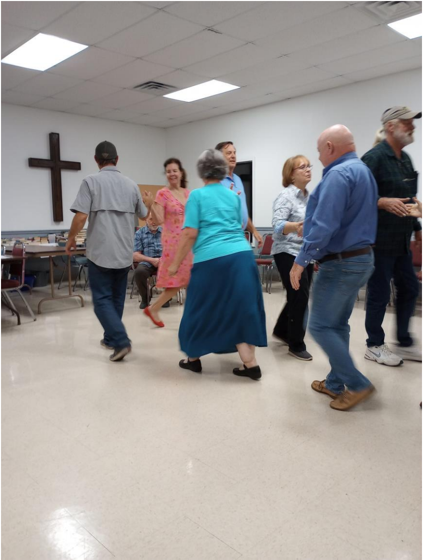
Next, some photos from the Levi's And Lace Oct. 14 dance.