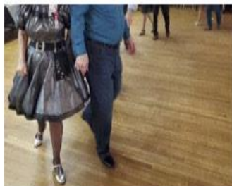
WOODEN DANCE FLOOR

Fairfield Inn & Suites Fultondale/I-65 1795 Morris Avenue Fultondale, AL 35068 205-849-8484 (call for booking link) $159/night Rate expires December 6, 2022