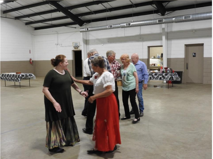
Next, several photos from the Bluebird Squares Life Is Good Taco Bar Dance on Oct. 15. See their club report for details.