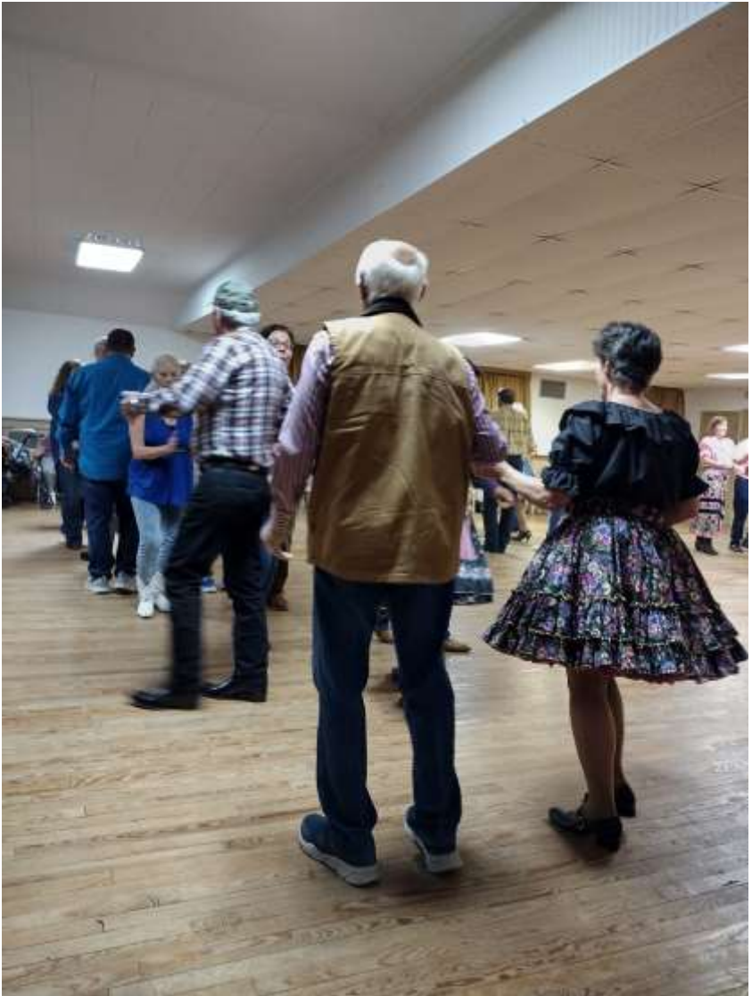
Next, photos from the Maverick Mixers Spring Fling Spaghetti Dinner and Dance on April 29 th .