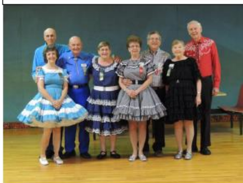
Hot Springs Village