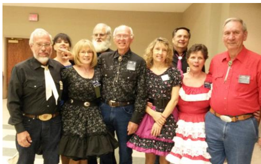
Round Dance Workshop