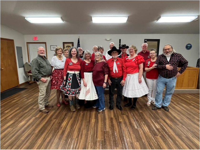
Next, two photos from the Heber Springs Feb. 23 dance; see their club report for details.