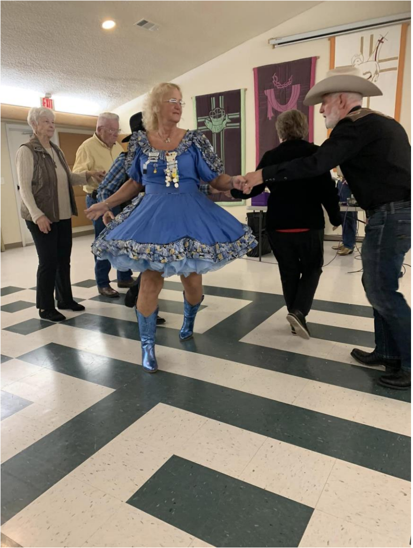
Next, several photos from the River City Squares Graduation Dance on Jan. 30, 2024...see their club report for details.