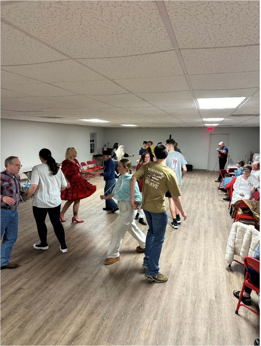
Next, several photos from the Levi's And Lace Feb. 23 dance.