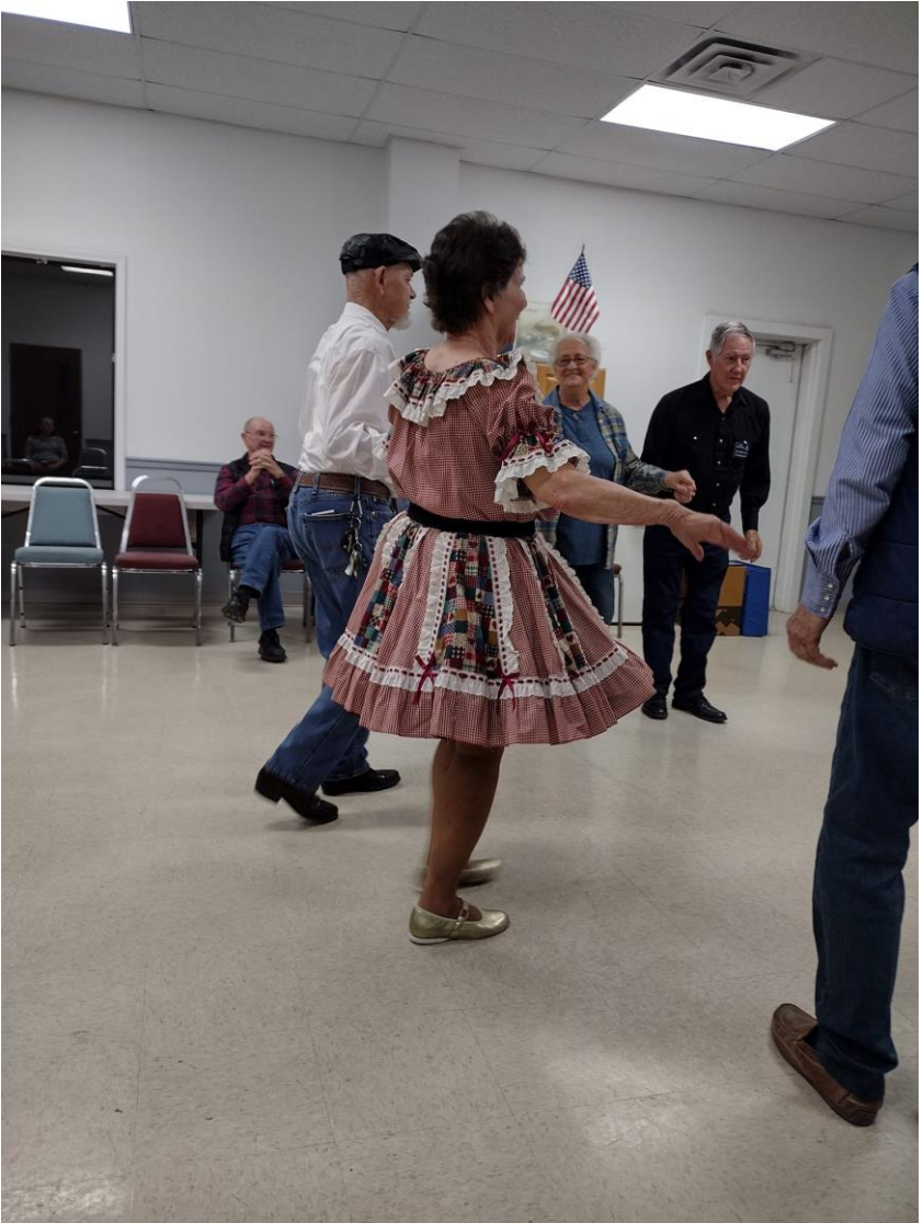
Next, several photos from the Maverick Mixers Feb. 24 dance. The first photo is of photographer Ginny Short.