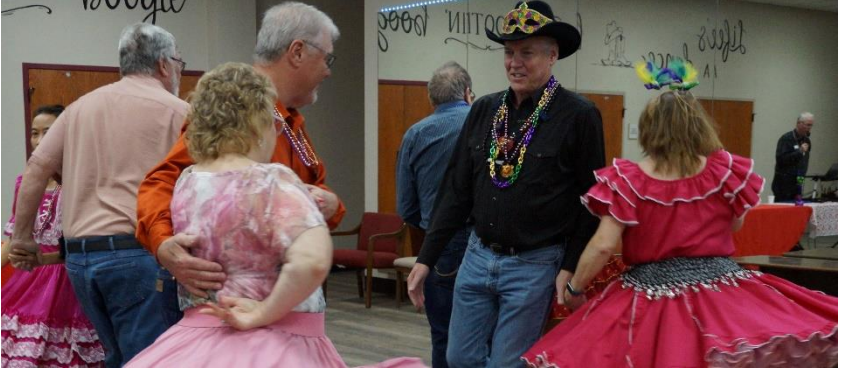
Next, 2 photos from the Heber Springs Valentine's Dance; see their club report for details.