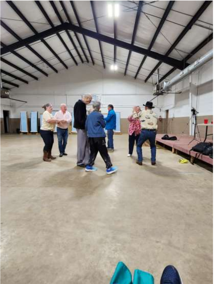
Lastly, several photos from the Maverick Mixers March 11 Dance.