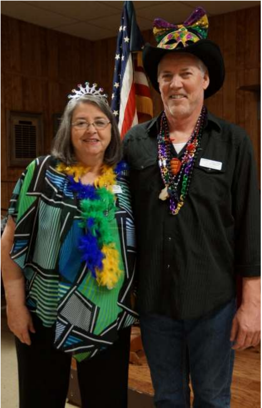
Their Mardi Gras Dance King And Queen