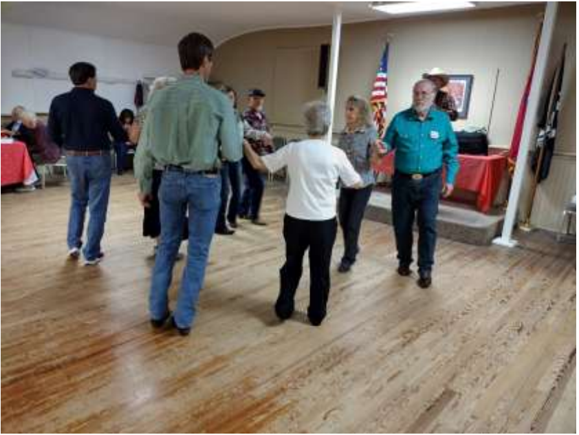
Next, a few photos from the Bluebird Squares March 4 Dance.