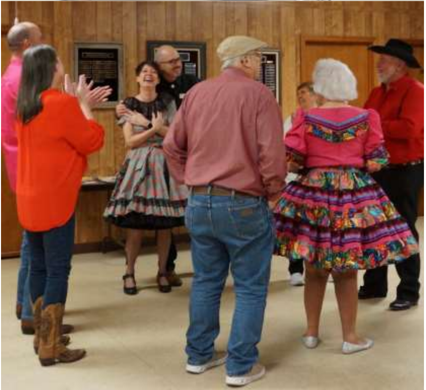
Next, several photos from their Feb. 21 Mardi Gras Dance.