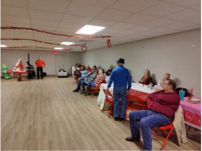
Next, several photos from the Maverick Mixers Feb. 25 Dance.