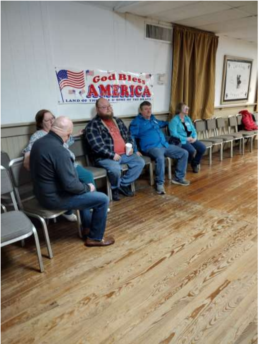
Next, several photos from the River City Squares Feb. 28 dance, now back at their regular dance location (the Fort Smith Senior Center), after a floor repair.