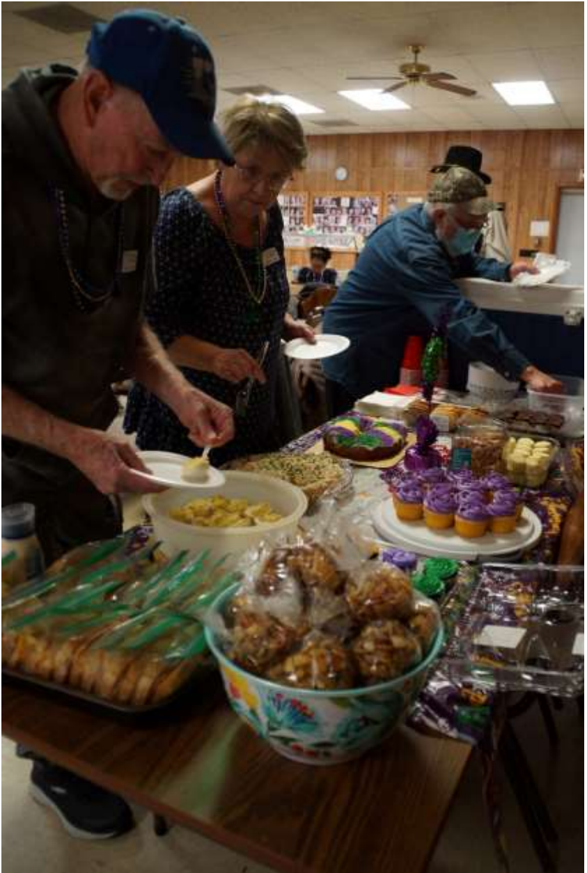
Again, another benefit at a dance – the duty square!!