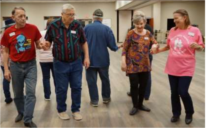
Next, several photos from the Twirling Lariats March 3 Dance.