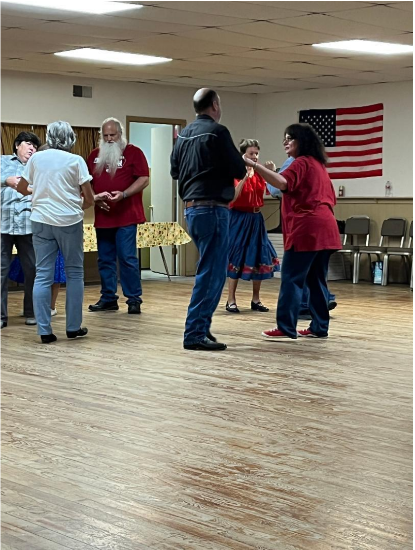
Next, several photos from the Maverick Mixers Thanks and Giving Dance on Nov. 25.