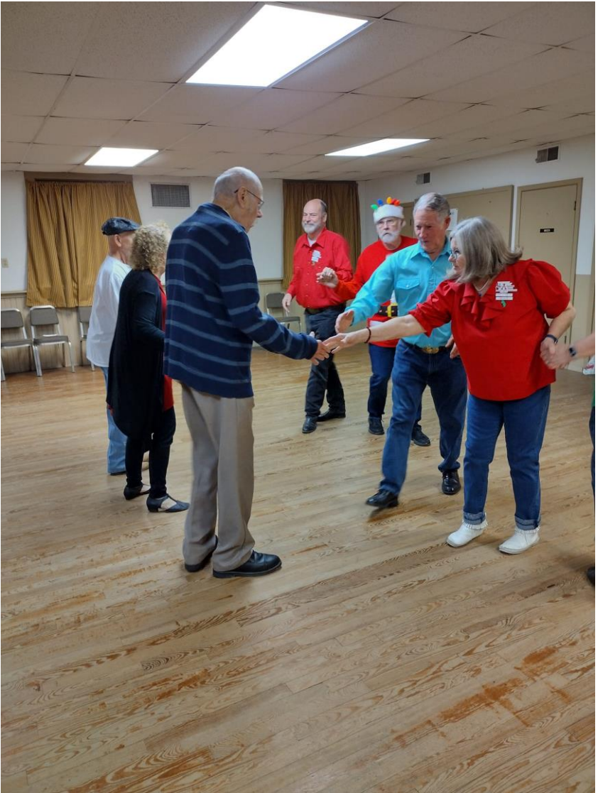
Next, 2 photos from the Twirling Funtimers Christmas and Graduation Dance.