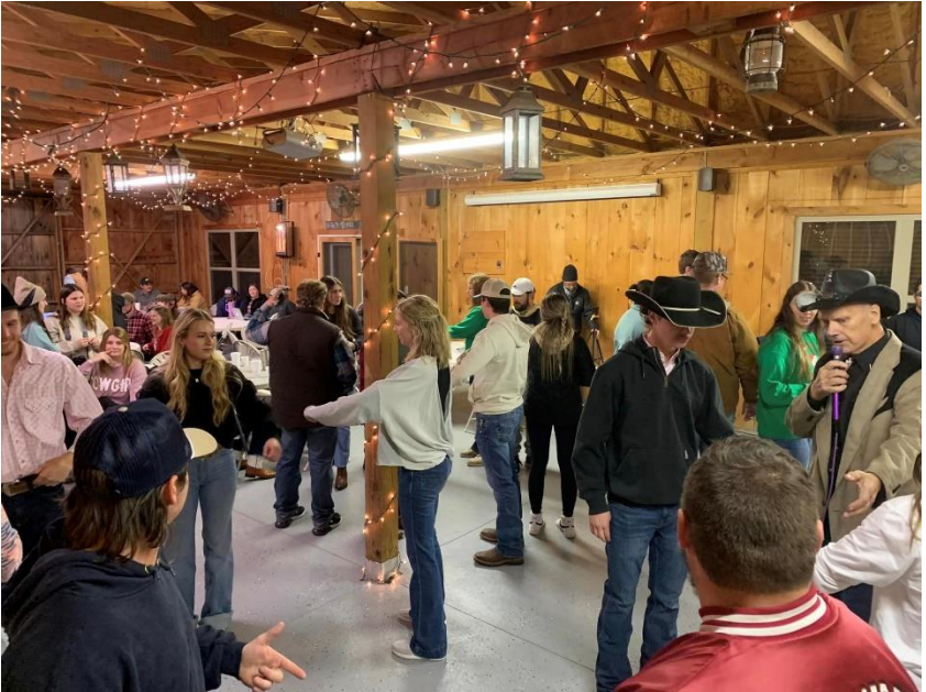
Next, several photos from the River City Squares Nov. 21, 2023 Dance.