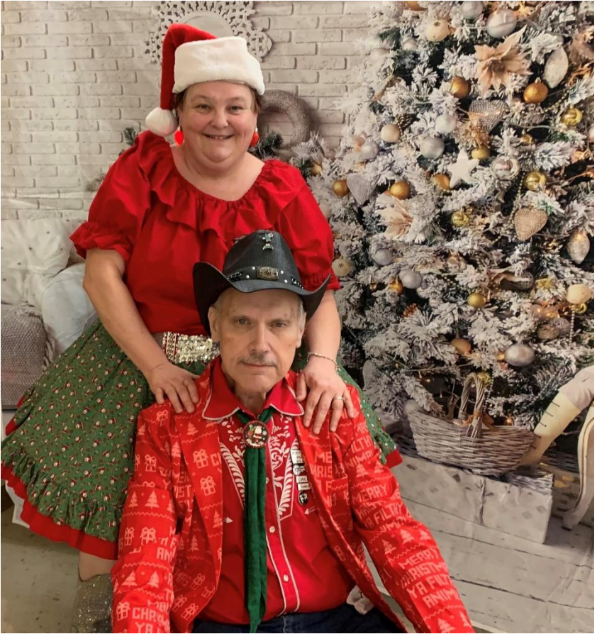
Next, several photos from the River City Squares Christmas Dance on Dec. 19, 2023.