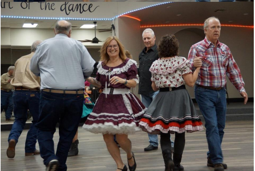
Next, several photos from the Twirling Lariats Dec. 1, 2023 Dance.