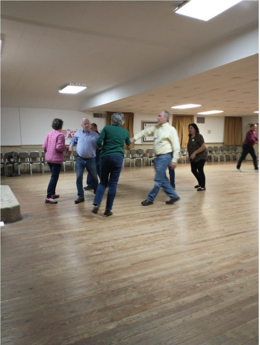
Next, a couple of photos from the Pioneers Dec. 4, 2023 dance, with 6 couples in a square.