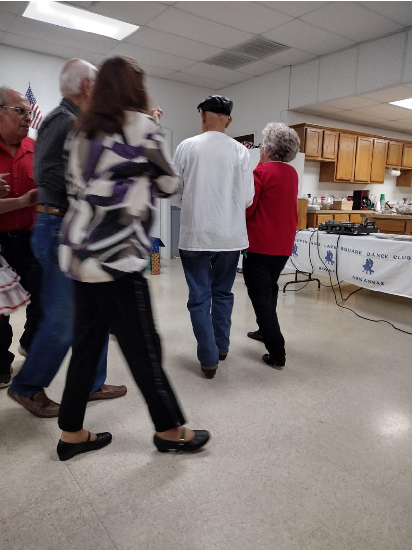
Next, several photos from the Maverick Mixers Dec. 9, 2023 dance.