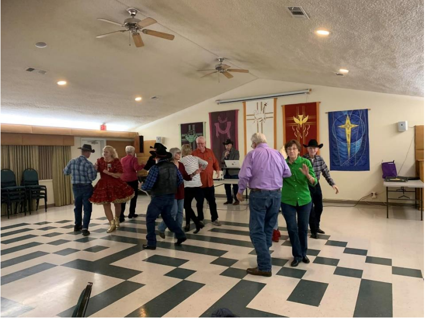
Next, several photos from the Levi's And Lace Christmas Dance on Dec. 8, 2023.