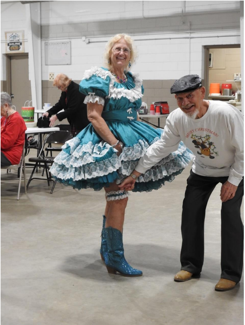
Next, several photos from the Maverick Mixers Christmas Ho Ho Hoedown Dance on Dec. 23.