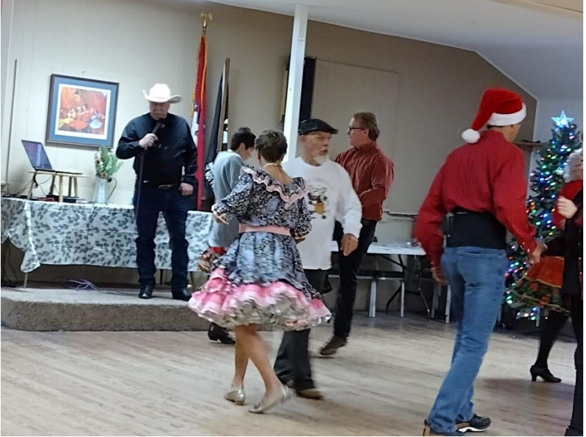
Next, several photos from the Bluebird Squares Dec. 16 Christmas Dance.