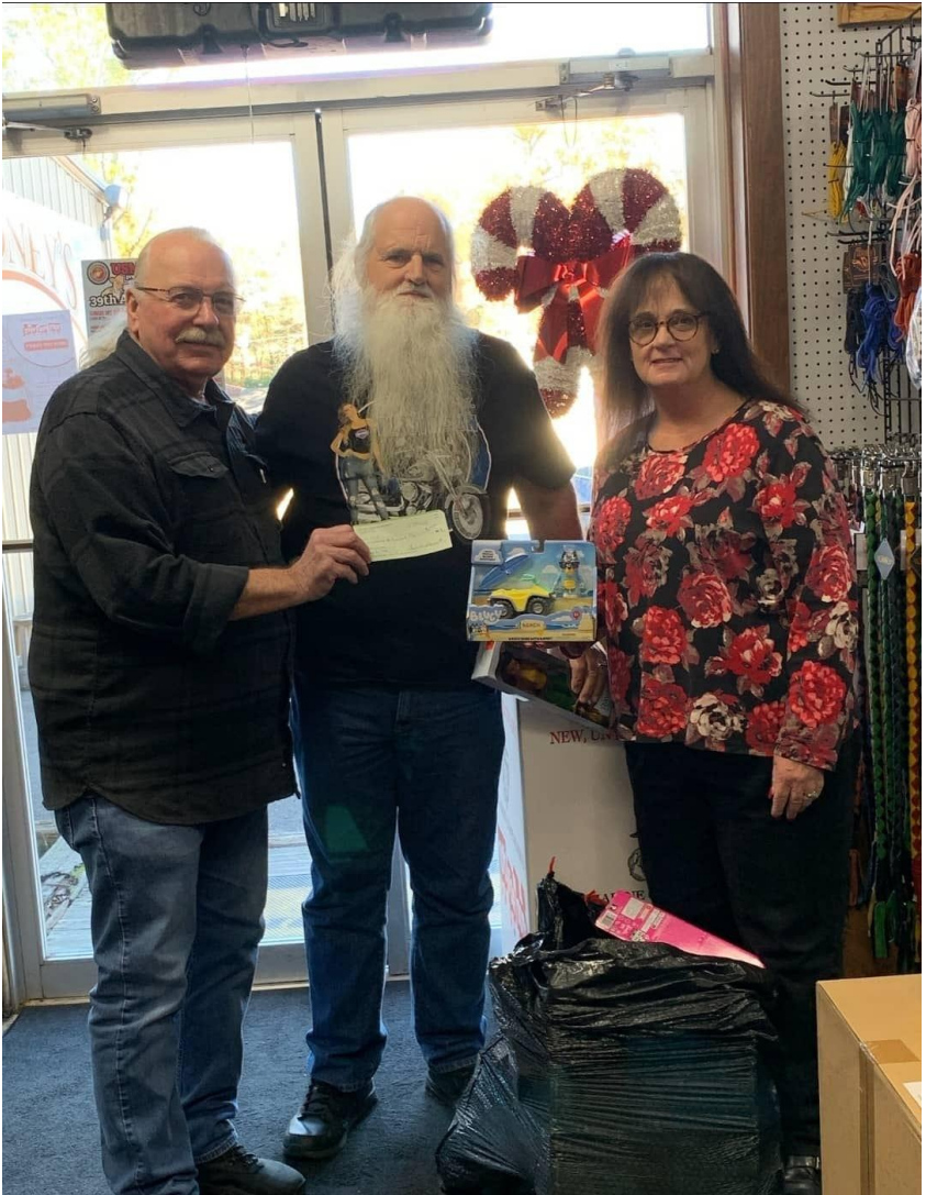
Next, a couple of photos from the Pioneers doing Teaching at Baptist College in Russellville, Arkansas...in a break just before the fall semester final exams.